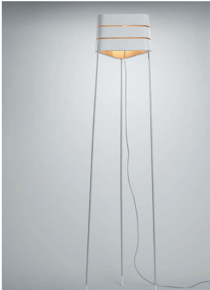
Left hansandfranz Booth 874 Munich 81671 Germany 49-89-95841258 hansandfranz.de info@hansandfranz.com